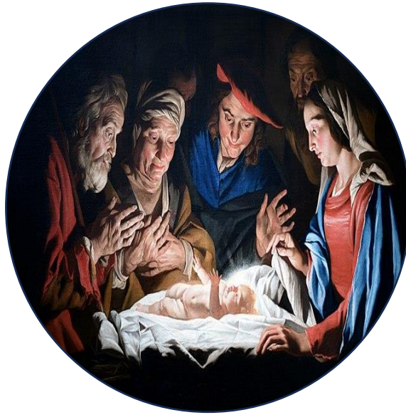
Adoration of the Shepherd by Matthias Stomer, 1632